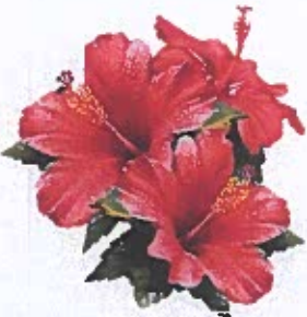
Village Flower: "Hibiscus"