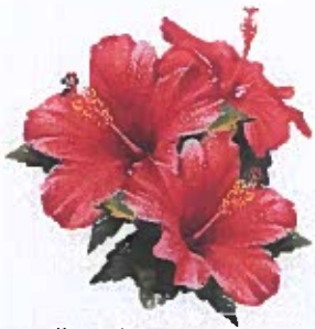
Village Flower: "Hibiscus"

Government of Guam - P.O. Box 786 Hagåtña, Guam 96932 Telephone: 828-8312/2941 - Fax: 828-2429